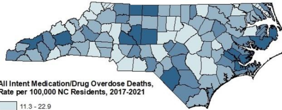
All Intent Medication/Drug Overdose Deaths, Rate per 100,000 NC Residents, 2017-2021